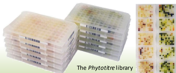
The Phytotitre library

Phytochemicals occupy a chemical space with a far greater structural diversity than synthetic compound libraries, and tend to be more 'drug-like', with superior ADME/T (absorption, distribution, metabolism, excretion and toxicity) properties. The typical 'hit-rate' of natural product library screens also tends to be far higher, 1 largely due to their inherent enrichment in molecules that interact with conserved protein domains, and the millennia of intense selective pressure faced by plants to develop secondary metabolites that target specific pathways in microbes or herbivores, including mammals. Accordingly, more than half of new drugs approved between 1981 and 2010 were derived or inspired from nature. 4